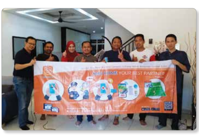
"This system helps us to differentiate and monitor residents easily."